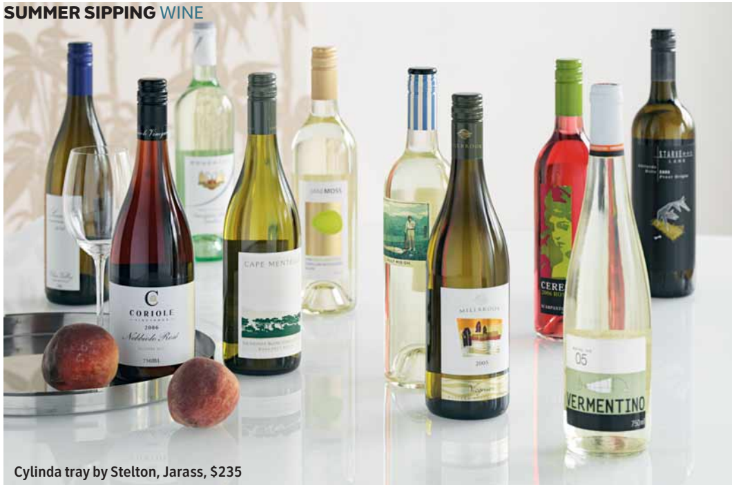
Cylinda tray by Stelton, Jarass, $235