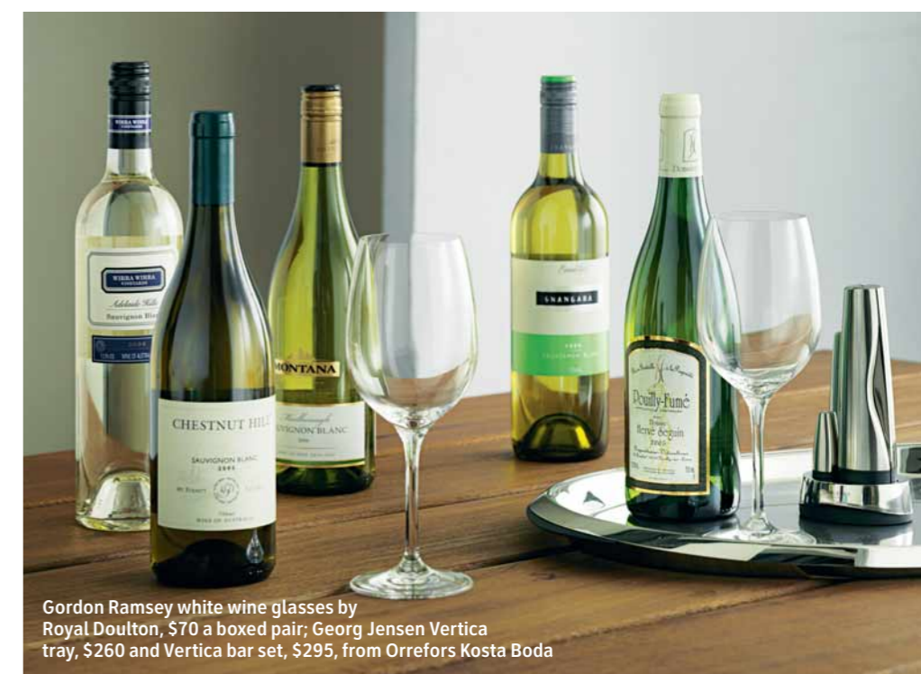
Gordon Ramsey white wine glasses by Royal Doulton, $70 a boxed pair; Georg Jensen Vertica tray, $260 and Vertica bar set, $295, from Orrefors Kosta Boda

New Zealand's Marlborough sauvignon blanc has taken the world by storm. Montana is one of the benchmark styles and fruit is sourced from different sites, giving this wine a complex aroma and flavour profile. Tropical notes of passionfruit and nectarine mingle with lemongrass and capsicum, >