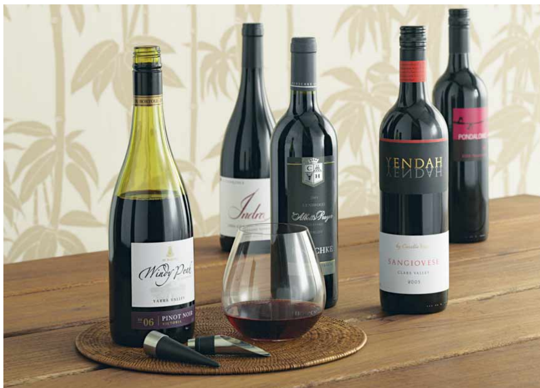
Orson and Blake rattan placemat, $35; Rosendahl stopper, $45, and pourer, $58, from Jarass; Riedel O series stemless glassware, $21.50 each

crisp and vivacious in the mouth. Match with antipasto.