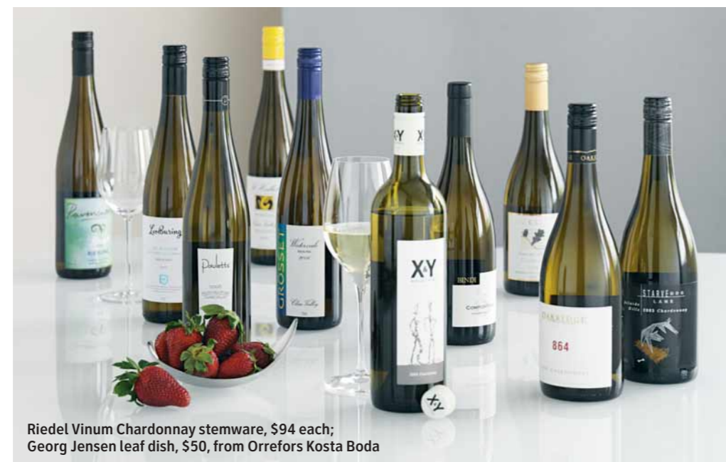
Riedel Vinum Chardonnay stemware, $94 each; Georg Jensen leaf dish, $50, from Orrefors Kosta Boda

Reliably excellent and widely available. Striking grapefruit citrus aromas; bright, deliciously expressive riesling fruit, finer flinty quartz mineral, florals